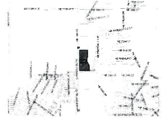
VICINITY SKETCH NO SCALE

OWNER KIMBERLEY PROPERTIES INC P.O. BOX 369 ANKENTY, IOWA 50021-0369